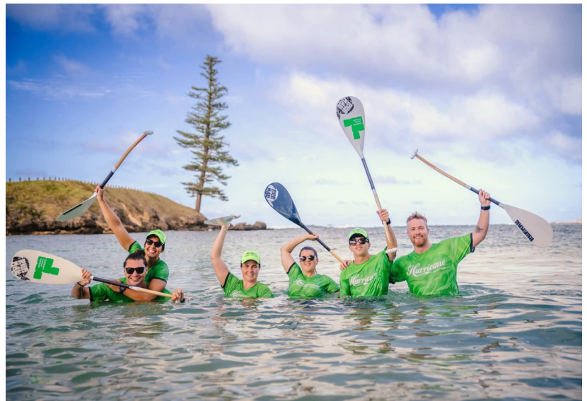
OC6 Mixed Hurricane crew