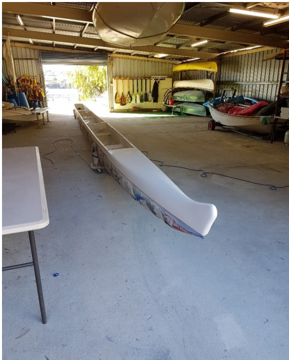
The boat shed looks very different today

Photos of the past which contributed to the clubs growth and success to make Hurricane the largest outrigger club in W.A.